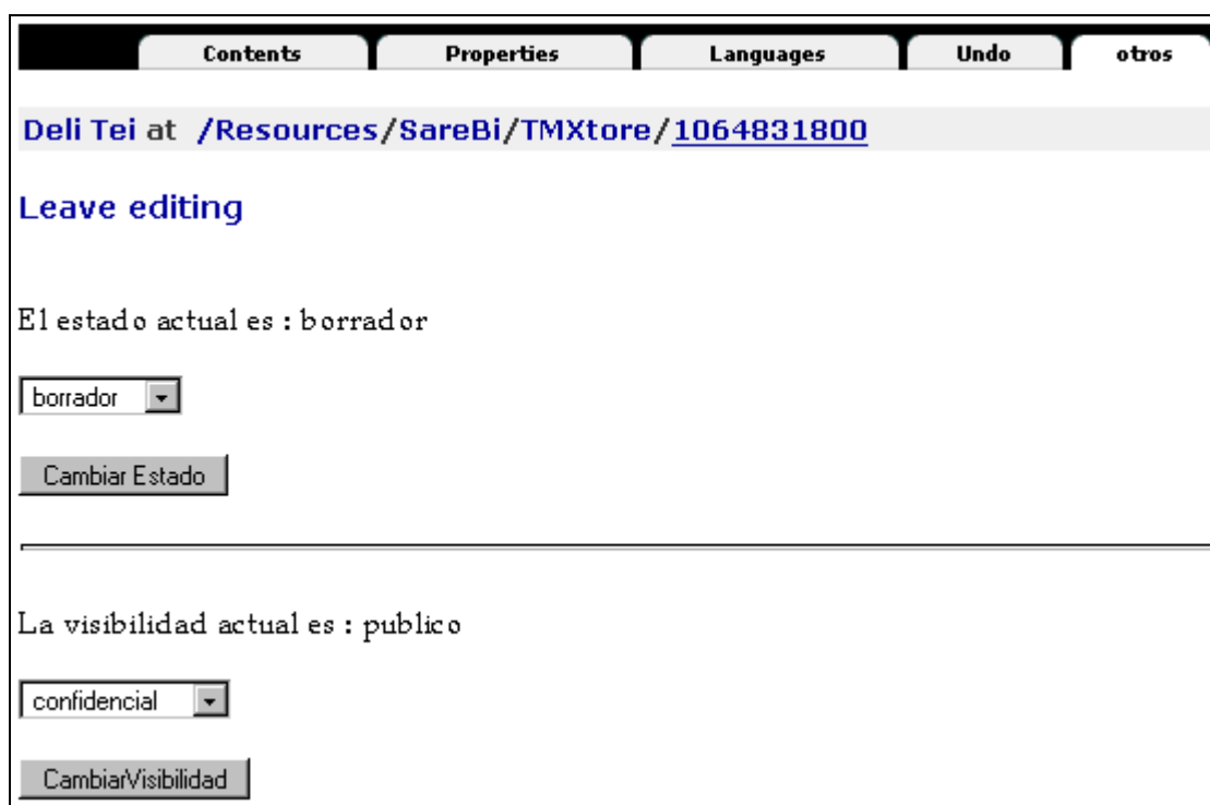
Figure 9: Modifying state and visibility metadata

Metadata that inform of the state and the visibility (confidentiality) of the document are also very important, and special indeed. Metadata other than these are static : they are assigned at the moment of creation of a document, and usually, they do not change (unless there were any mistakes). On the contrary, state and visibility are dynamic : their values change throughout the edition cycle to show the composition/multilinguism situation of the document. To this end, users are given one of the tabs shown in the document modification page (figure 6), as seen in figure 9.